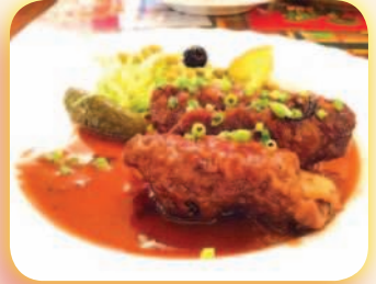
Plums and apples wrapped in beef

I have yet to try a dish at Perestroika I don't like. The restaurant's borscht, a red broth made from beets and other vegetables, is subtle, yet full of warmth and flavor. It pairs well with pirozhka—a soft, bready dumpling filled with minced meat and cabbage. Both borscht and pirozhka are included in Perestroika's three courses, which are different dinner sets offering significant savings if you want to sample several items.