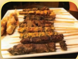
Skewer sampler plate

While I appreciate the investment in those little details, it wouldn't much matter if the food wasn't good. Fortunately, 360 Grille's eye for detail extends to its kitchen's offerings, too. The menu is an eclectic mix: the appetizers alone range from chips and salsa, to Italian bruschetta, to calamari. Entrées include salads, sandwiches, burgers and sushi, plus steaks, burgers, and interestingly, exotic meat like kangaroo and ostrich.