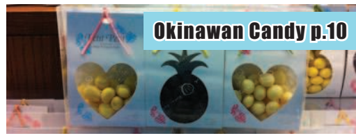
Okinawan Candy p.10